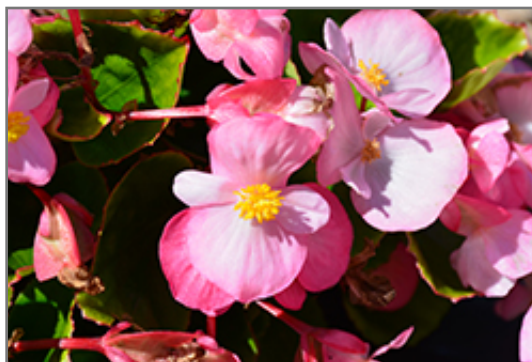
Sprint Plus Pink Begonia flowers

This is a high maintenance plant that will require regular care and upkeep, and usually looks its best without pruning, although it will tolerate pruning. Deer don't particularly care for this plant and will usually leave it alone in favor of tastier treats. Gardeners should be aware of the following characteristic(s) that may warrant special consideration;