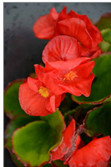
Sprint Plus Red Begonia flowers

This is a high maintenance plant that will require regular care and upkeep, and usually looks its best without pruning, although it will tolerate pruning. Deer don't particularly care for this plant and will usually leave it alone in favor of tastier treats. Gardeners should be aware of the following characteristic(s) that may warrant special consideration;