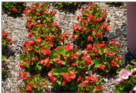
Sprint Plus Red Begonia in bloom