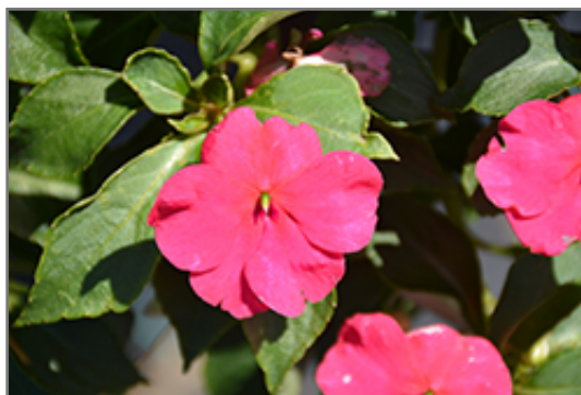
Beacon Rose Impatiens flowers