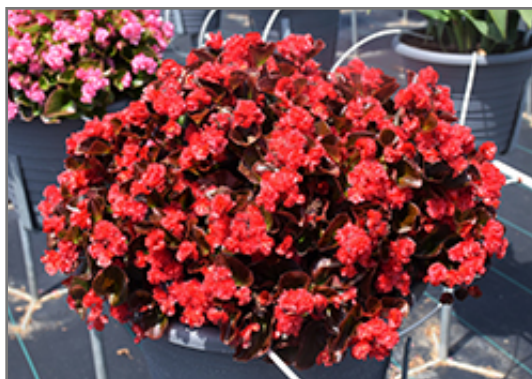
Double Up Red Begonia in bloom