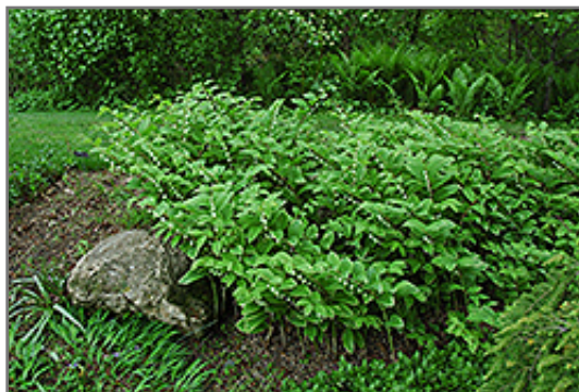
Variegated Solomon's Seal in bloom