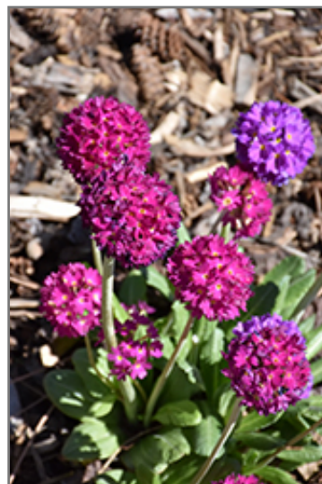
Drumstick Primrose flowers