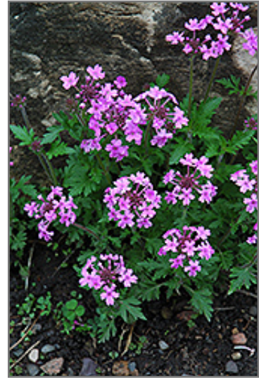
Drumstick Primrose in bloom

This plant does best in partial shade to shade. It does best in average to evenly moist conditions, but will not tolerate standing water. It is not particular as to soil type or pH. It is somewhat tolerant of urban pollution, and will benefit from being planted in a relatively sheltered location. Consider covering it with a thick layer of mulch in winter to protect it in exposed locations or colder microclimates. This species is not originally from North America.