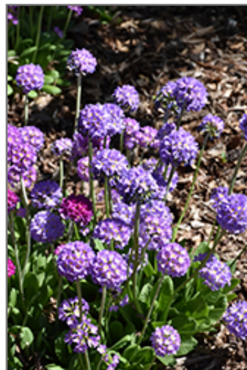
Drumstick Primrose in bloom