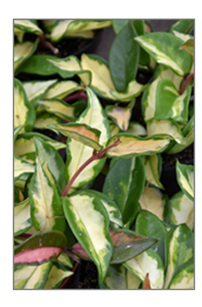
Variegated Wax Plant foliage

When grown indoors, Variegated Wax Plant can be expected to grow to be about 12 inches tall at maturity, with a spread of 5 feet. It grows at a medium rate, and under ideal conditions can be expected to live for approximately 10 years. This houseplant should be situated in a location that that gets indirect sunlight at most, although it will usually require a more brightly-lit environment than what artificial indoor lighting alone can provide. It is very adaptable to both dry and moist soil, but will not tolerate any standing water. The surface of the soil shouldn't be allowed to dry out completely, and so you should expect to water this plant once and possibly even twice each week. Be aware that your particular watering schedule may vary depending on its location in the room, the pot size, plant size and other conditions; if in doubt, ask one of our experts in the store for advice. It is not particular as to soil pH, but grows best in rich soil. Contact the store for specific recommendations on pre-mixed potting soil for this plant.