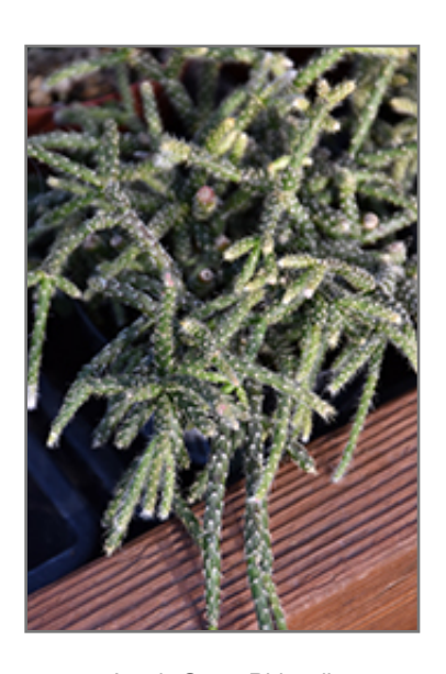
Jungle Snow Rhipsalis

When grown indoors, Jungle Snow Rhipsalis can be expected to grow to be about 20 inches tall at maturity, with a spread of 3 feet. It grows at a slow rate, and under ideal conditions can be expected to live for approximately 30 years. This houseplant performs well in both bright or indirect sunlight and strong artificial light, and can therefore be situated in almost any well-lit room or location. This is a unique plant in that it requires extremely dry, well-drained soil, and it will die if left in standing water for any length of time - in fact it will suffer if it is over-watered. The soil should be allowed to go completely dry to the touch an inch or two deep for prolonged periods, and it may only need watering once every few weeks. Be aware that your particular watering schedule may vary depending on its location in the room, the pot size, plant size and other conditions; if in doubt, ask one of our experts in the store for advice. Like most succulents and cacti, it prefers to grow in poor soils and should therefore never be fertilized. It is not particular as to soil type or pH; an average potting soil should work just fine.