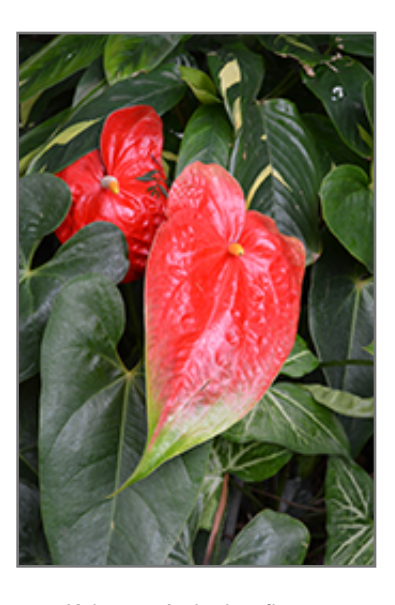
Kalapana Anthurium flowers

When grown indoors, Kalapana Anthurium can be expected to grow to be about 24 inches tall at maturity, with a spread of 24 inches. It grows at a medium rate, and under ideal conditions can be expected to live for approximately 5 years. This houseplant performs well in both bright or indirect sunlight and strong artificial light, and can therefore be situated in almost any well-lit room or location. It does best in average to evenly moist soil, but will not tolerate standing water. The surface of the soil shouldn't be allowed to dry out completely, and so you should expect to water this plant once and possibly even twice each week. Be aware that your particular watering schedule may vary depending on its location in the room, the pot size, plant size and other conditions; if in doubt, ask one of our experts in the store for advice. It is not particular as to soil type, but has a definite preference for acidic soil. Contact the store for specific recommendations on pre-mixed potting soil for this plant. Be warned that parts of this plant are known to be toxic to humans and animals, so special care should be exercised if growing it around children and pets.