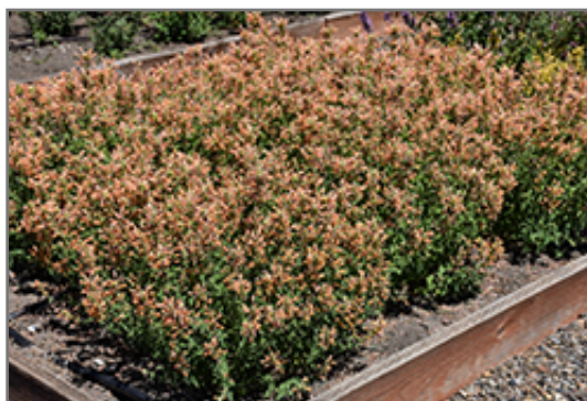
Kudos Gold Hyssop in bloom