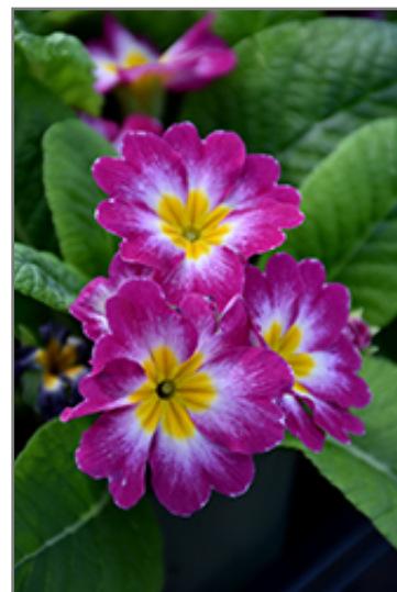
Danova Wine Bicolor Primrose flowers

When grown indoors, Danova Wine Bicolor Primrose can be expected to grow to be only 6 inches tall at maturity, with a spread of 7 inches. It grows at a fast rate, and under ideal conditions can be expected to live for approximately 5 years. This houseplant performs well in both bright or indirect sunlight and strong artificial light, and can therefore be situated in almost any well-lit room or location. It does best in average to evenly moist soil, but will not tolerate standing water. The surface of the soil shouldn't be allowed to dry out completely, and so you should expect to water this plant once and possibly even twice each week. Be aware that your particular watering schedule may vary depending on its location in the room, the pot size, plant size and other conditions; if in doubt, ask one of our experts in the store for advice. It is not particular as to soil type or pH; an average potting soil should work just fine.