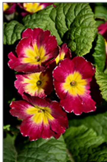
Primera Wine Flame Shades Primrose flowers

When grown indoors, Primera Wine Flame Shades Primrose can be expected to grow to be only 6 inches tall at maturity, with a spread of 6 inches. It grows at a fast rate, and under ideal conditions can be expected to live for approximately 5 years. This houseplant performs well in both bright or indirect sunlight and strong artificial light, and can therefore be situated in almost any well-lit room or location. It requires an evenly moist well-drained soil for optimal growth, but will suffer if left to grow in standing water. The surface of the soil shouldn't be allowed to dry out completely, and so you should expect to water this plant once and possibly even twice each week. Be aware that your particular watering schedule may vary depending on its location in the room, the pot size, plant size and other conditions; if in doubt, ask one of our experts in the store for advice. It is not particular as to soil type or pH; an average potting soil should work just fine.