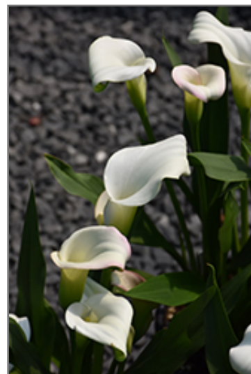
Classic Pink Calla Lily flowers

A gorgeous and unique looking selection perfect for indoor containers and planters; narrow, glossy green foliage gives way to bright white spathes; a lovely addition to any fresh cut arrangement