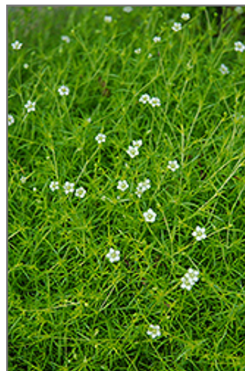
Scotch Moss flowers

Scotch Moss will grow to be only 1 inch tall at maturity, with a spread of 12 inches. Its foliage tends to remain low and dense right to the ground. It grows at a medium rate, and under ideal conditions can be expected to live for approximately 10 years. As an evergreen perennial, this plant will typically keep its form and foliage year-round.