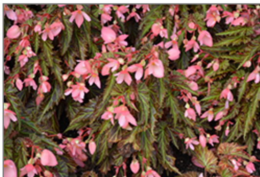
I'Conia Upright Salmon Begonia flowers

I'Conia Upright Salmon Begonia is recommended for the following landscape applications;