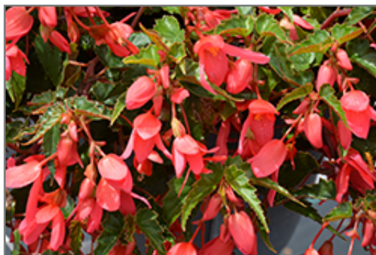
Groovy Rose Begonia flowers