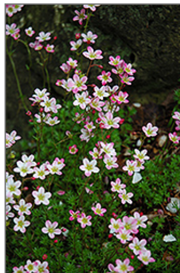
Toyo Yatsubusa Saxifrage flowers

Toyo Yatsubusa Saxifrage features tiny shell pink star-shaped flowers with lemon yellow eyes and cherry red tips at the ends of the stems from early to late spring, which emerge from distinctive red flower buds. Its needle-like leaves remain emerald green in color throughout the season.