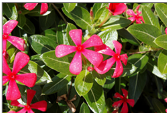
Soiree Kawaii Red Shades Vinca flowers

Soiree Kawaii Red Shades Vinca is a dense herbaceous annual with a trailing habit of growth, eventually spilling over the edges of hanging baskets and containers. Its medium texture blends into the garden, but can always be balanced by a couple of finer or coarser plants for an effective composition.