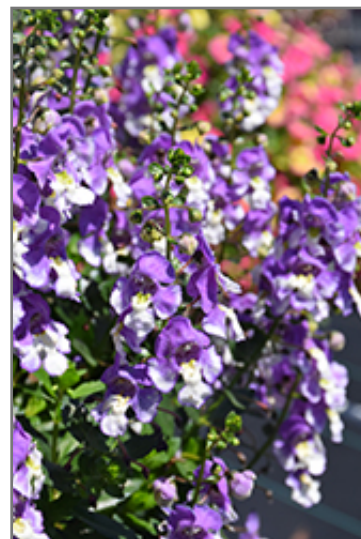
Alonia Big Bicolor Purple Angelonia flowers

Alonia Big Bicolor Purple Angelonia is recommended for the following landscape applications;