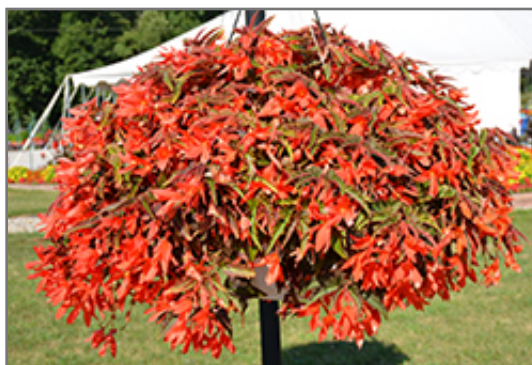
Bossa Nova Night Fever Papaya Begonia in bloom