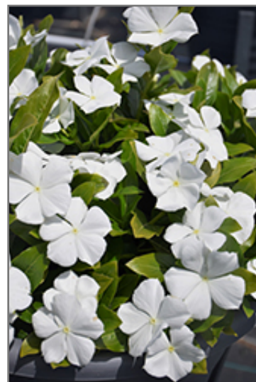
Cora Cascade White Vinca flowers

Cora Cascade White Vinca is recommended for the following landscape applications;