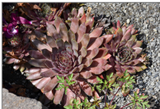
Kalinda Hens And Chicks

Kalinda Hens And Chicks is recommended for the following landscape applications;