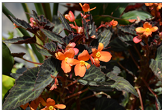
Glowing Embers Begonia flowers