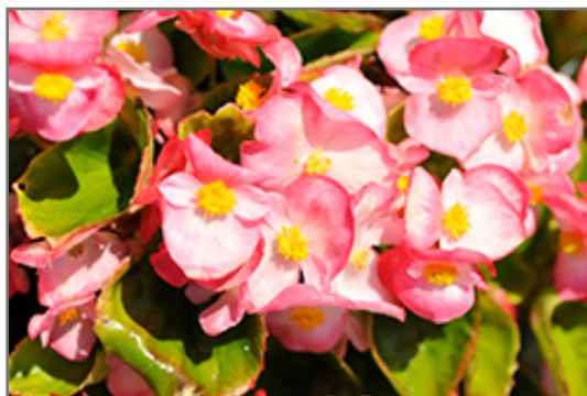
Super Cool Blush Begonia flowers

Super Cool Blush Begonia is recommended for the following landscape applications;