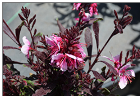
Bantam Pink Gaura flowers