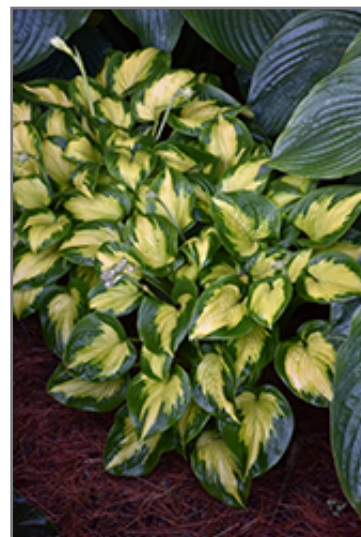
Shadowland Etched Glass Hosta