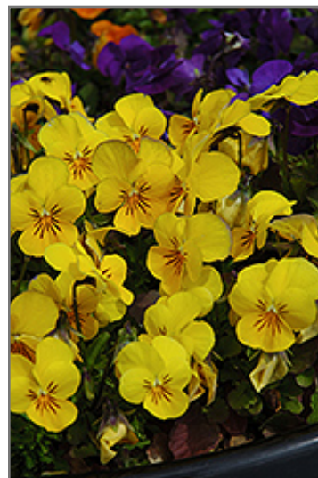
Penny Yellow Pansy flowers