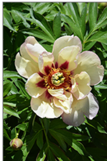
Pastel Splendor Peony flowers