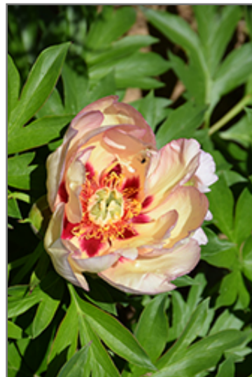
Pastel Splendor Peony flowers

Pastel Splendor Peony is recommended for the following landscape applications;