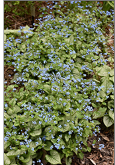
Jack Frost Bugloss in bloom

Jack Frost Bugloss is a fine choice for the garden, but it is also a good selection for planting in outdoor pots and containers. It is often used as a 'filler' in the 'spiller-thriller-filler' container combination, providing a mass of flowers and foliage against which the thriller plants stand out. Note that when growing plants in outdoor containers and baskets, they may require more frequent waterings than they would in the yard or garden.