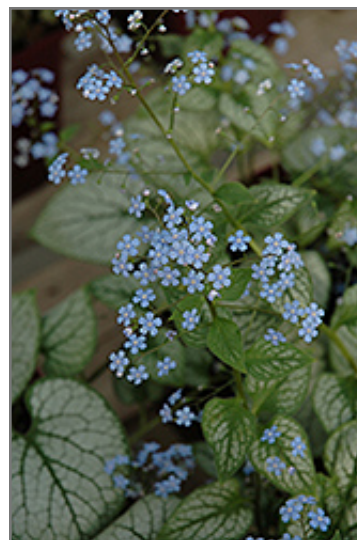
Jack Frost Bugloss flowers