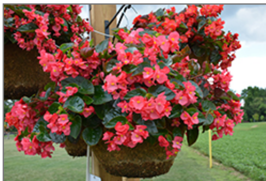
Viking Explorer Rose on Green Begonia in bloom