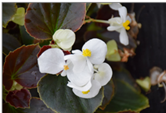
Eureka Bronze Leaf White Begonia flowers