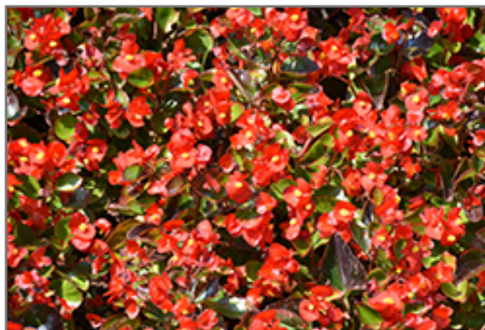
Ambassador Scarlet Begonia flowers