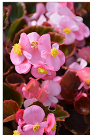
Cocktail Brandy Begonia flowers

This plant will require occasional maintenance and upkeep. Trim off the flower heads after they fade and die to encourage more blooms late into the season. Deer don't particularly care for this plant and will usually leave it alone in favor of tastier treats. Gardeners should be aware of the following characteristic(s) that may warrant special consideration;