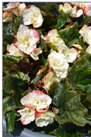
Frivola White Begonia flowers