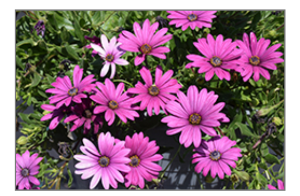
Tradewinds Deep Purple African Daisy flowers