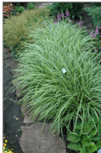
Ice Dance Sedge