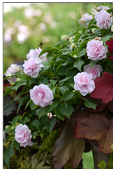
Glimmer Appleblossom Double Impatiens flowers