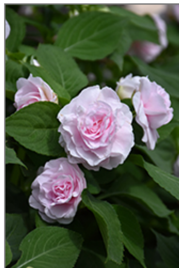
Glimmer Appleblossom Double Impatiens flowers

Glimmer Appleblossom Double Impatiens is recommended for the following landscape applications;