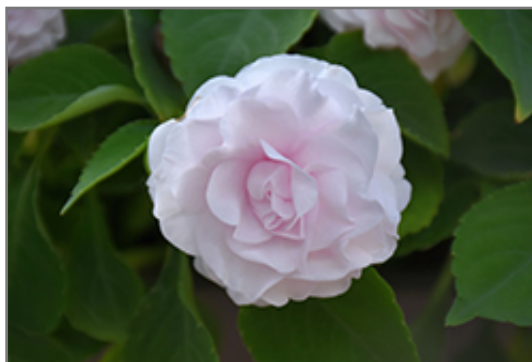
Glimmer White Double Impatiens flowers