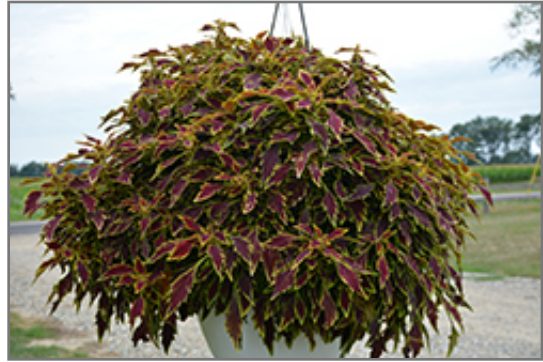
FlameThrower Serrano Coleus

FlameThrower Serrano Coleus will grow to be about 18 inches tall at maturity, with a spread of 16 inches. When grown in masses or used as a bedding plant, individual plants should be spaced approximately 15 inches apart. Although it's not a true annual, this fast-growing plant can be expected to behave as an annual in our climate if left outdoors over the winter, usually needing replacement the following year. As such, gardeners should take into consideration that it will perform differently than it would in its native habitat.