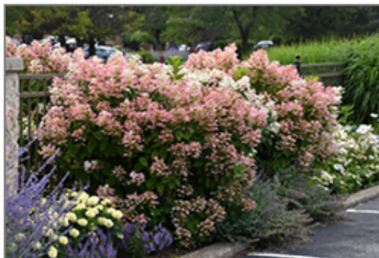
Quick Fire Hydrangea in bloom