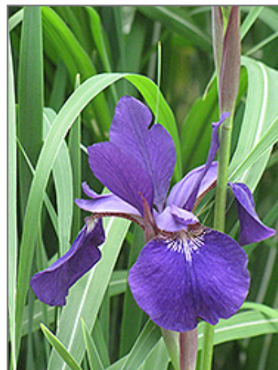
Caesar's Brother Siberian Iris flowers