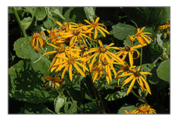
Othello Rayflower flowers