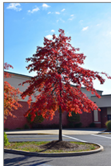
Pin Oak in fall