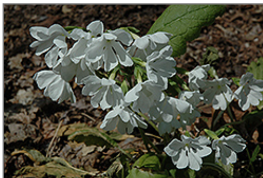
Snowflakes Primrose flowers