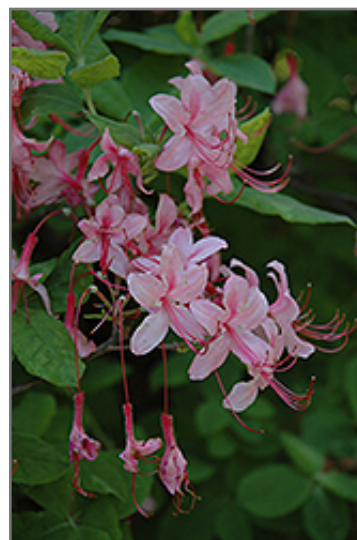
Pinxterbloom Azalea flowers