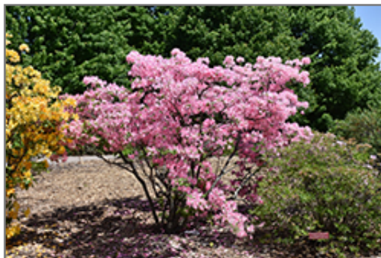
Northern Lights Azalea in bloom