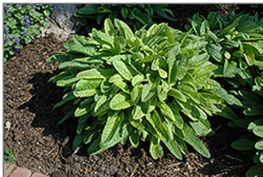
Hummelo Betony