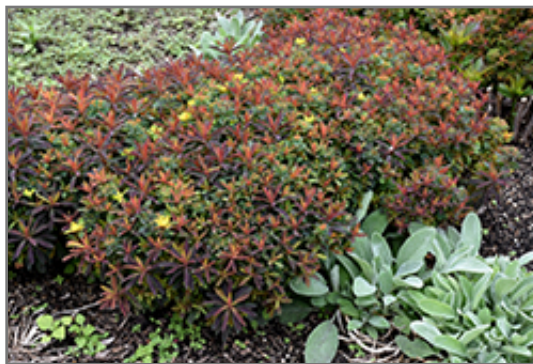
Bonfire Cushion Spurge