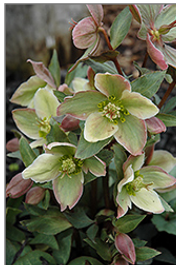
Ivory Prince Hellebore flowers

Ivory Prince Hellebore is recommended for the following landscape applications;