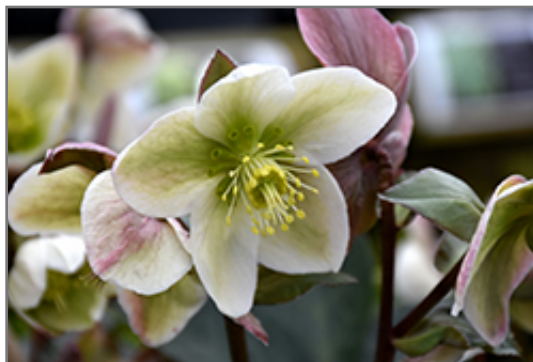
Ivory Prince Hellebore flowers