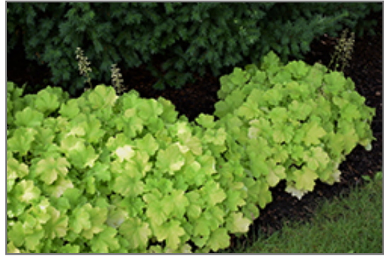
Citronelle Coral Bells in bloom

Citronelle Coral Bells is a fine choice for the garden, but it is also a good selection for planting in outdoor pots and containers. It is often used as a 'filler' in the 'spiller-thriller-filler' container combination, providing a mass of flowers and foliage against which the larger thriller plants stand out. Note that when growing plants in outdoor containers and baskets, they may require more frequent waterings than they would in the yard or garden.