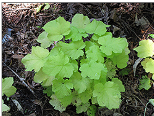
Citronelle Coral Bells